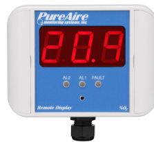
Remote Digital Display