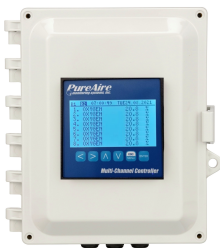
8 Channel Programmable Controller for O2 or Gas Monitors