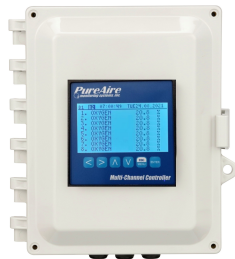
8 Channel Programmable Controller for O2 or Gas Monitors