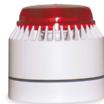
Red Horn/Strobe 24VDC