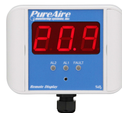
Remote Digital Display