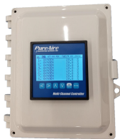
8 Channel Programmable Controller for O2 or Gas Monitors