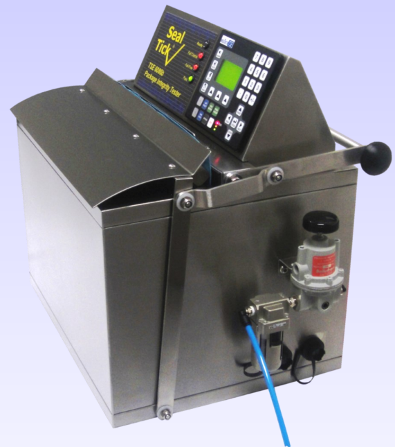
Seal Tick in operation position. Pass/Fail lamps indicate when test is finished.

Compressed air consumption: 60 Ltrs/min intermittent