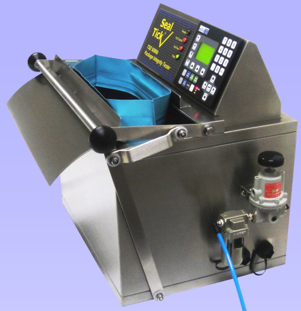
Seal Tick in open position ready for package to be loaded. Closing the handle starts the test cycle.

"The Seal Tick machine is easy for our operators to use. The passed product can go back onto the line, no damage occurs to product during the testing process."